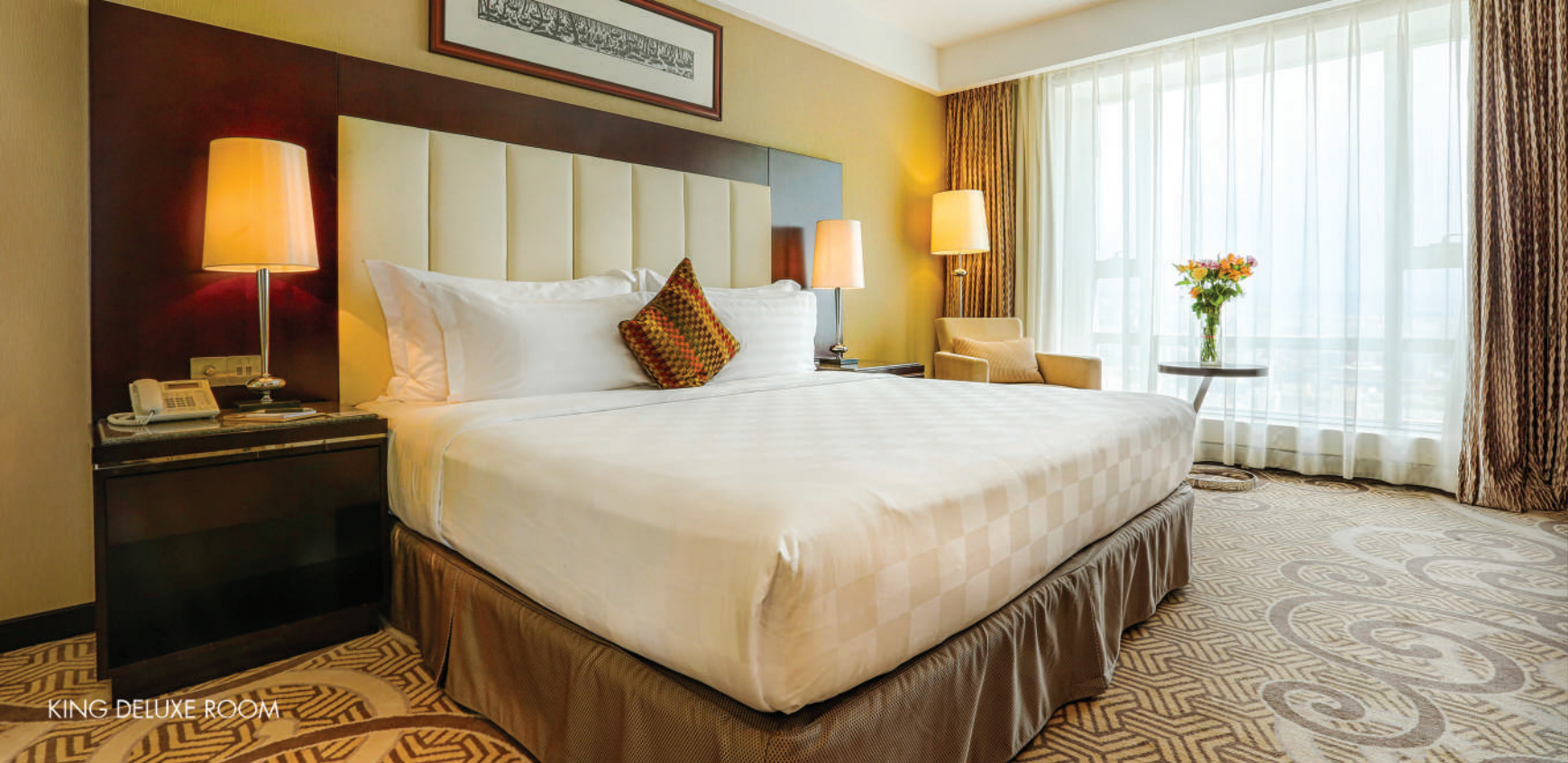
KING DELUXE ROOM