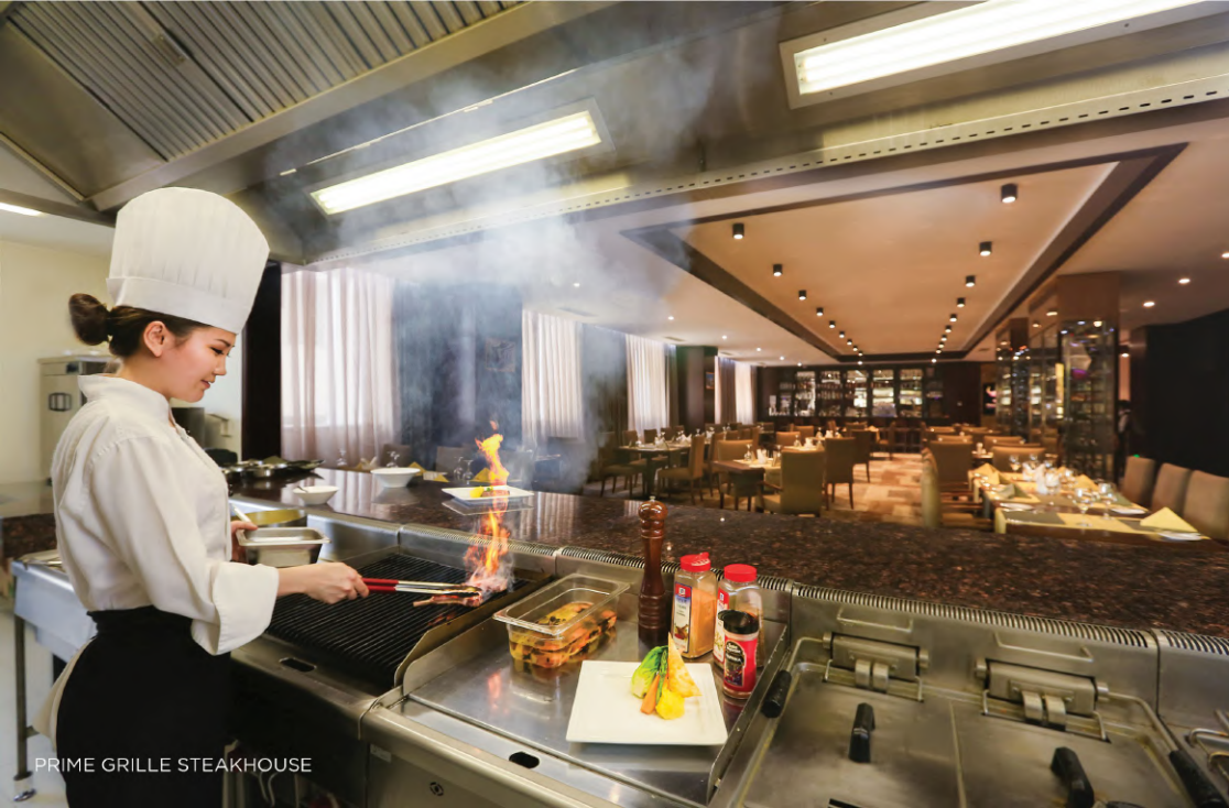
PRIME GRILLE STEAKHOUSE