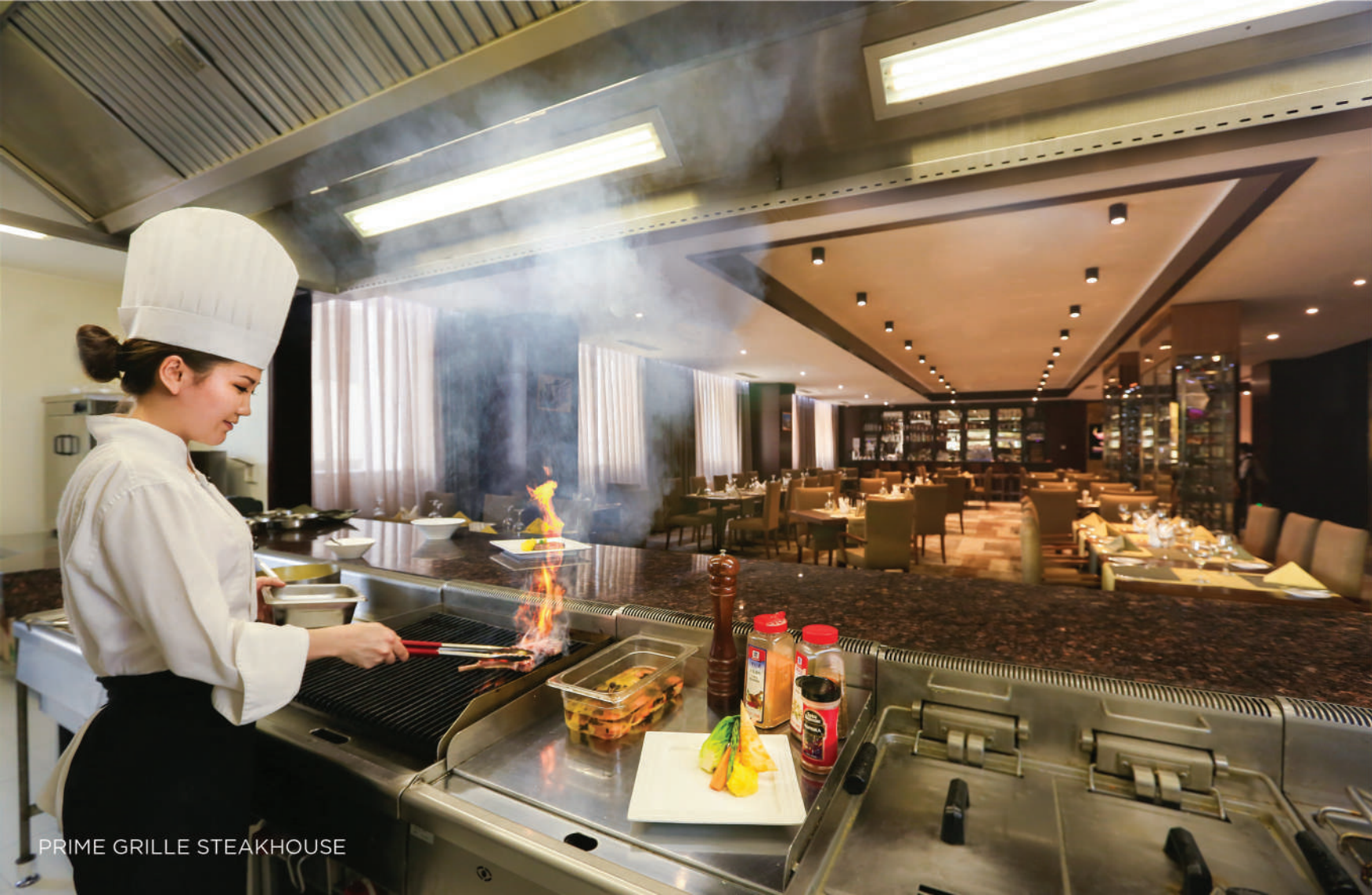
PRIME GRILLE STEAKHOUSE